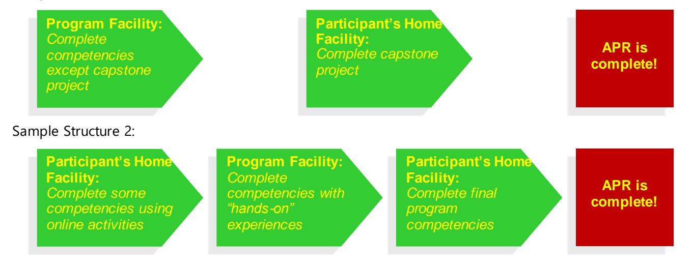
Figure 2. Possible curricular organization patterns.

It is the responsibility of the program to determine the best curricular organization to meet its goals and to meet the needs of its participants.