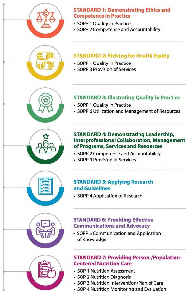
Figure 2. Standards Crosswalk. Crosswalk of 2017 Standards of Practice (SOP) and Standards of Professional Performance (SOPP) to the seven 2024 Standards.

Scope and standards documents are reviewed and revised every 7 years. In the 2017 revision, the Scope of Practice for the RDN 9 and the Standards of Practice (SOP) in Nutrition Care and Standards of Professional Performance (SOPP) for RDNs 10 were two separate documents. The two figures in the Revised 2017 SOP in Nutrition Care (4 standards) and SOPP (6 standards) for the RDN have been combined into one figure in the Revised 2024 article with 7 standards as outlined in Figure 2 . Additionally, combining the scope and standards documents and figures reduces repetition, improves readability and accessibility, and recognizes the changing practice environment toward efficiency.