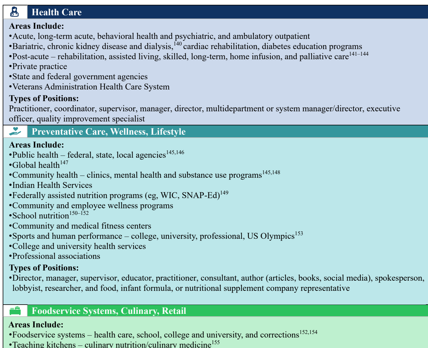
Figure 5. Practice Areas for RDNs

Core education and supervised practice, work and volunteer experiences, targeted continuing education, and applicable certifications have greatly expanded opportunities for RDNs. Figure 5 highlights a variety of practice areas where individuals would find RDNs serving as practitioners, supervisors, managers, directors, vice-presidents, chief executive officers within organizations or across systems, educators, researchers, media spokespeople, authors, website developers, sustainability leaders, state and federal agency directors or staff, or any other type of position the RDN wants to pursue consistent with interests, qualifications, and individual scope of practice.