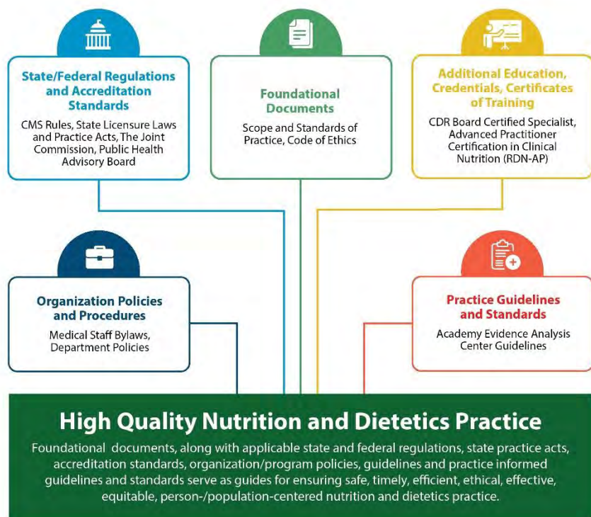
Figure 3. Elements of High Quality Nutrition and Dietetics Practice