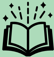
Tools and Resources